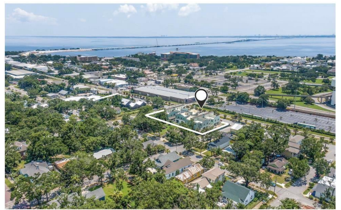
Less than a mile distance to the waterfront of beautiful Pensacola Bay.