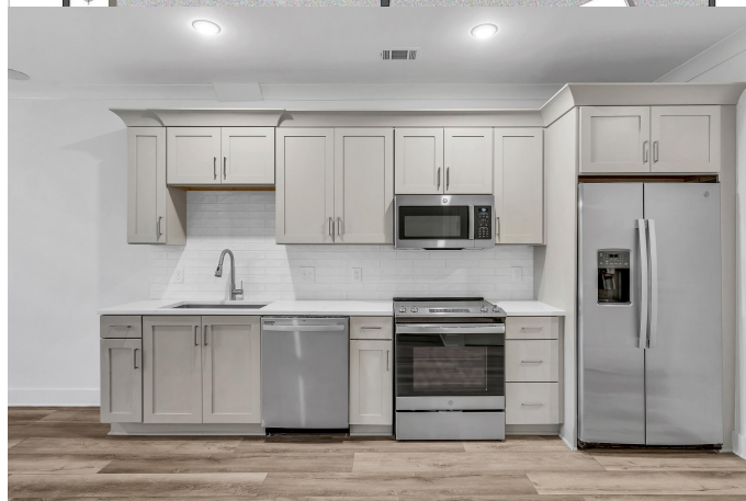
SPRUCE PINE PLAN (785 SQ. FT.)