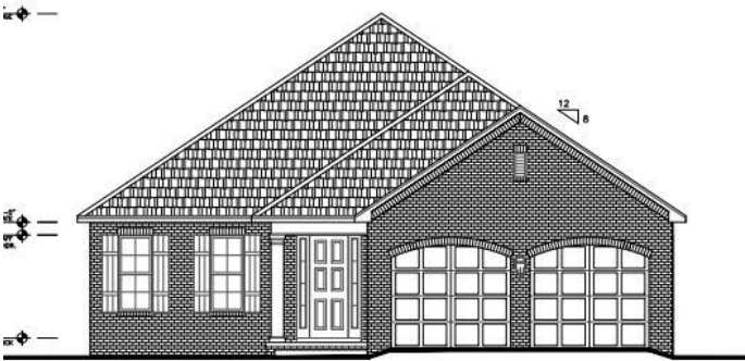
1 FRONT ELEVATION SCALE: 1/4" = 1'-0"