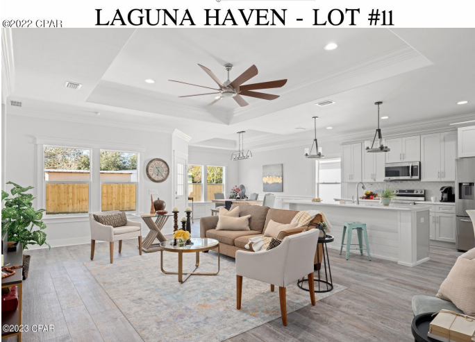
LAGUNA HAVEN - LOT #11