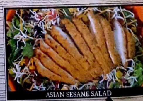
ASIAN SESAME SALAD

■ QUORN VEGETARIAN NUGGETS AVAILABLE UPON REQUEST.