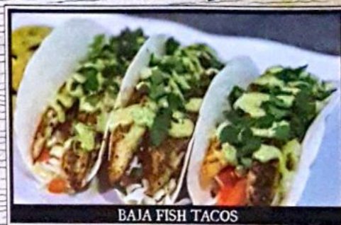
BAJA FISH TACOS