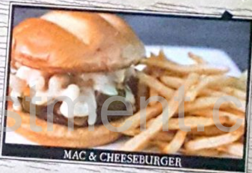
MAC & CHEESEBURGER

For the burger purist. Two juicy seasoned mid-sized burgers topped with american cheese on toasted pretzel buns. They taste like a million bucks, but we'll cut you a deal. $10.95