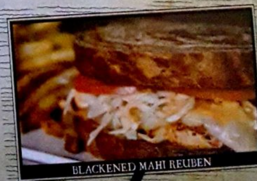
BLACKENED MAHI REUBEN

Our delicious take on a reuben sandwich! Featuring a juicy, blackened mahi fillet with crunchy shredded cabbage, cool tomato slices, melted swiss cheese and our special Island sauce on toasted marble rye bread. $12.95