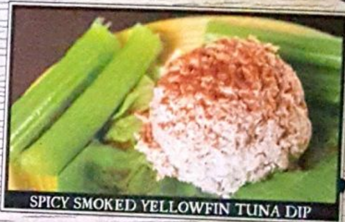
SPICY SMOKED YELLOWFIN TUNA DIP

Another Island original. Our zesty 3 cheese blend generously "Lei'd" on top of a pile of warm tortilla chips. Finished with the perfect marriage of flavors in jalapeño slices, shredded lettuce, our signature Pineapple Coconut Rum Slaw and smoky diced BBQ chicken. $12.95