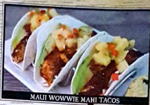
MAUI WOWWIE MAHI TACOS

A trio of warm tortillas piled high with crunchy cabbage, fresh diced tomatoes & garlic herb crusted organic Tilapia. All finished off with a drizzle of our homemade pesto Aioli and chopped fresh Cilantro. $12.95