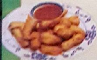
Sweet & Sour Chicken

B3 BBQ Pork Small $7.95 Large $10.95 Lunch $7.45