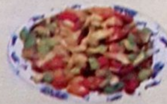
Kung Po Chicken