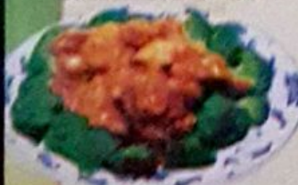
General Tso's Chicken